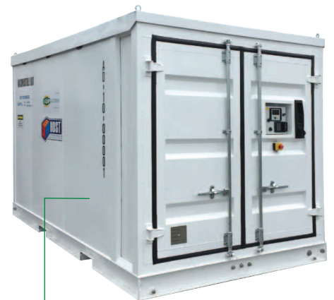
Insulated Stainless Steel internal tank

Including high quality stainless steel fittings throughout and many other valuable features as standard, HOST AdBlue Self Bunded Tanks really stack up on design and value.