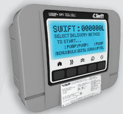
Swift Home Screen