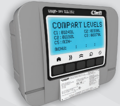
Swift One-touch Compartment Level screen