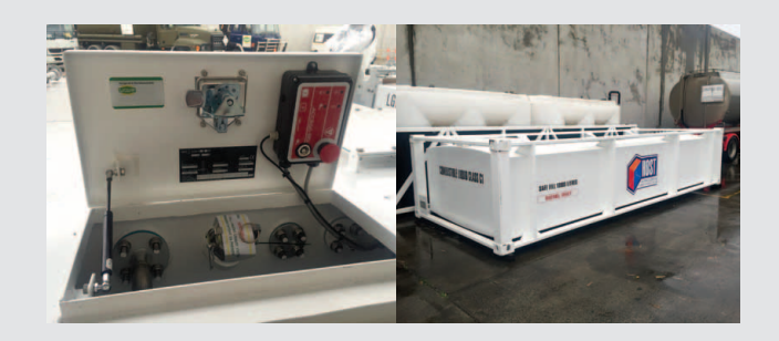
Cubes – Self Bunded Tank series tank sizes and models available from Liquip NSW